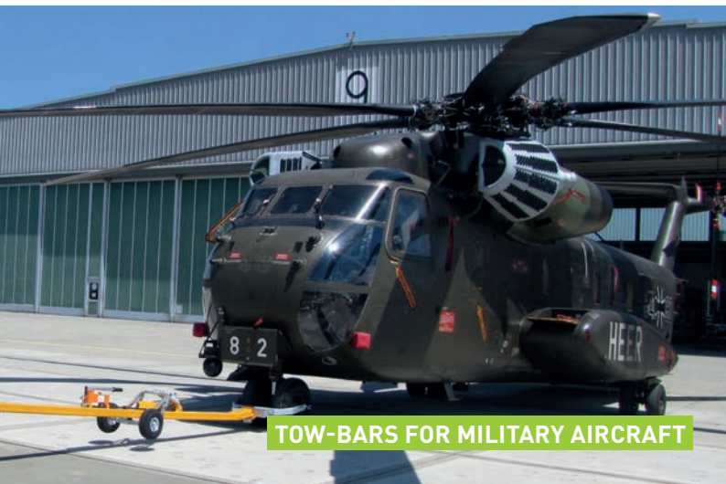
TOW-BARS FOR MILITARY AIRCRAFT