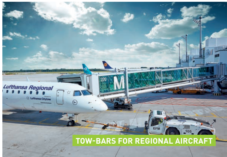
TOW-BARS FOR REGIONAL AIRCRAFT