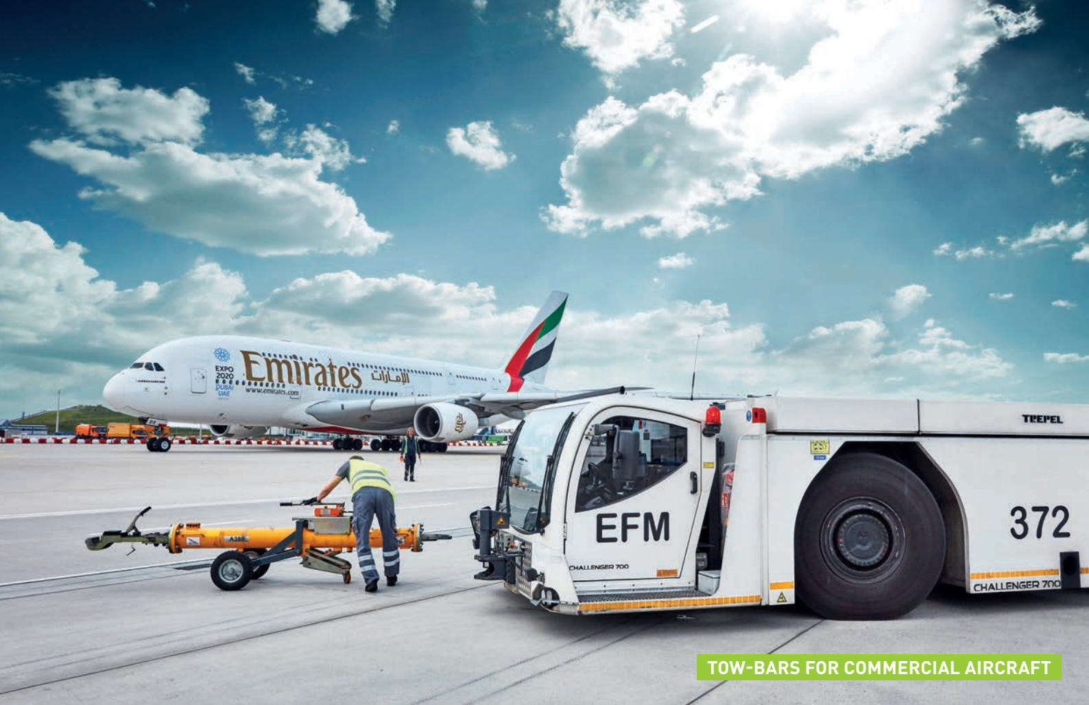
TOW-BARS FOR COMMERCIAL AIRCRAFT